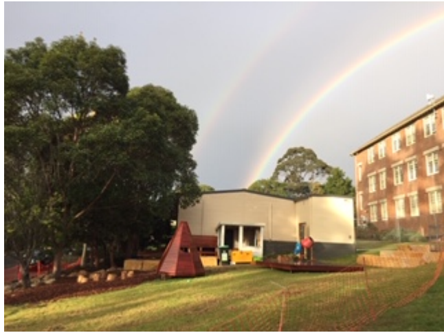
Sacred Heart School – “a Pot of Gold” at the end of the rainbow